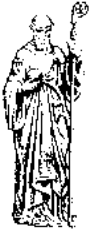
St. Columbkille, Patron Saint of Faith Formation